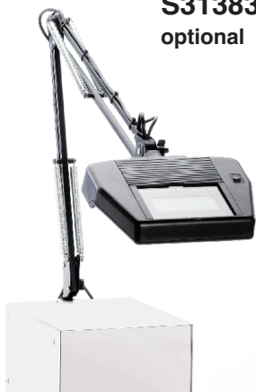
Unità ottica con lente 3x per Puk Optical unit with magnifier lens 3X for Puk

Alimentazione Voltage/Alimentation 230V ~1, 50/60 Hz Potenza lampada Lamp power / puissance lampe max. 9 W